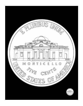
The 2006-Dated "Return to Monticello" Nickel

The announcement of the design of the obverse of the "Return to Monticello" nickel will occur in October 2005. The "Return to Monticello" nickel will be the final design in the United States Mint's Westward Journey Nickel Series<sup>TM</sup>.