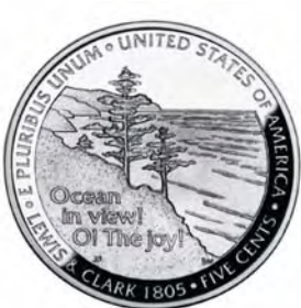
The "Ocean in View" 5-Cent Coin (Nickel)

In a conference report to Public Law 104-52 that created the United States Mint Public Enterprise Fund (PEF), Congress directed the United States Mint to report quarterly on implementation of the PEF. This report is designed to fulfill that requirement.