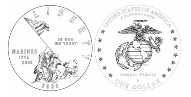
The Marine Corps 230th Anniversary Silver Dollar

A surcharge from the sale of each coin is authorized to go to the National Museum of the Marine Corps in Quantico, Virginia, which is currently being developed though a partnership between the Marine Corps Heritage Foundation and the United States Marine Corps.