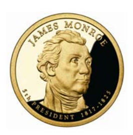
James Monroe Presidential $1 Coin

From January 1 through March 31, 2008 Second Quarter Fiscal Year 2008