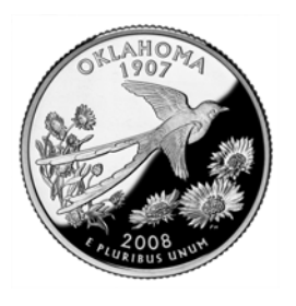
Oklahoma Commemorative Quarter-Dollar Coin

Second Quarter Fiscal Year (FY) 2008 Financials: FY 2008 second quarter revenue declined 12 percent from the same quarter last year because of declining demand for circulating coins. Numismatic revenue increased by 29%, while bullion revenue increased by 77%. FY 2008 year to date revenue was three percent above FY 2007 second quarter cumulative revenue.