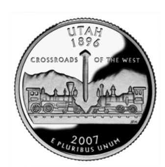
Utah Commemorative Quarter-Dollar Coin

The Utah quarter was the fifth quarter-dollar released in calendar year 2007, and the 45<sup>th</sup> to be introduced in the United States Mint's 50 State Quarters<sup>®</sup> Program. The reverse of the Utah quarter features two locomotives moving toward the golden spike that joined the Central Pacific and Union Pacific Railroads on May 10, 1869. The quarter commemorates that event, at Promontory, Utah, linking East and West regions of the United States. The reverse of the coin also bears the inscriptions "Crossroads of the West," "Utah," and "1896," the year Utah was admitted into the Union.