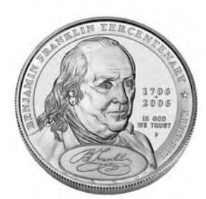
"The Founding Father"

In a conference report to Public Law 104-52 that created the United States Mint Public Enterprise Fund (PEF), Congress directed the United States Mint to report quarterly on implementation of the PEF. This report is designed to fulfill that requirement.